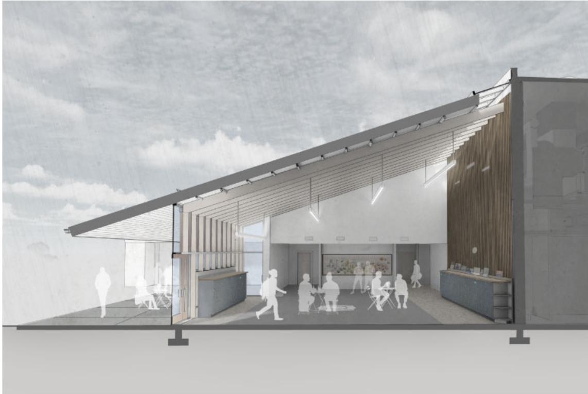
Interior View of New Roof and Dining Area